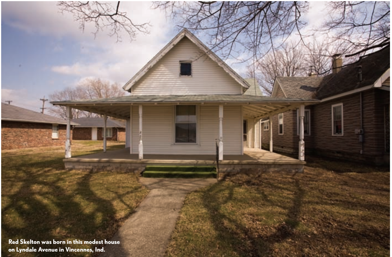
Red Skelton was born in this modest house on Lyndale Avenue in Vincennes, Ind.

He transitioned from radio to vaudeville theater to movies to a 20-year network television variety show that America tuned into for the antics of characters such as Clem Kadiddlehopper, Freddie the Freeloader, and a lawman called Sheriff Deadeye.