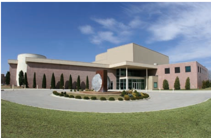
The Red Skelton Performing Arts Center is located on the Vincennes University campus. The front, left portion of the building is the shell that will house a Red Skelton museum.

ary 2006 after a decade of fundraising and construction.